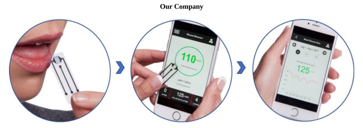
For illustrative purposes only – not Company products

On November 5, 2017, the Company effected a stock split of one to 90,000 shares resulting in 9,000,000 issued and outstanding shares of common stock as of that date and the date hereof. On August 9, 2018, the Company effected a reverse stock split of approximately one to 0.9167 shares that resulted in the Company having 8,250,000 issued and outstanding shares of common stock. Share and per share amounts set forth herein (except in any historical financial information) give effect to the reverse split, unless indicated otherwise.